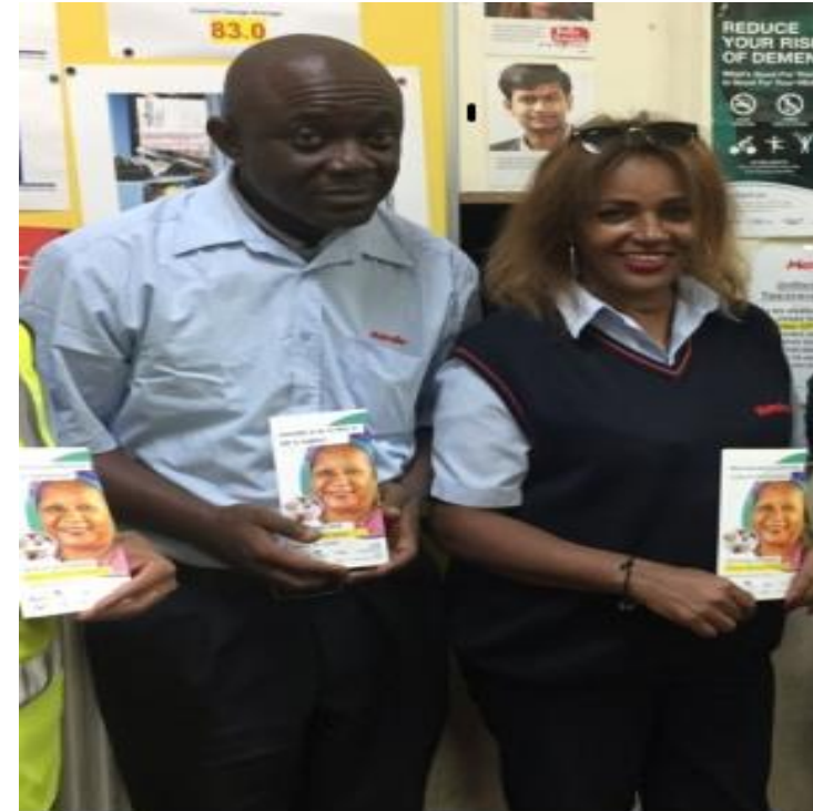
Metrolink bus drivers in Brent